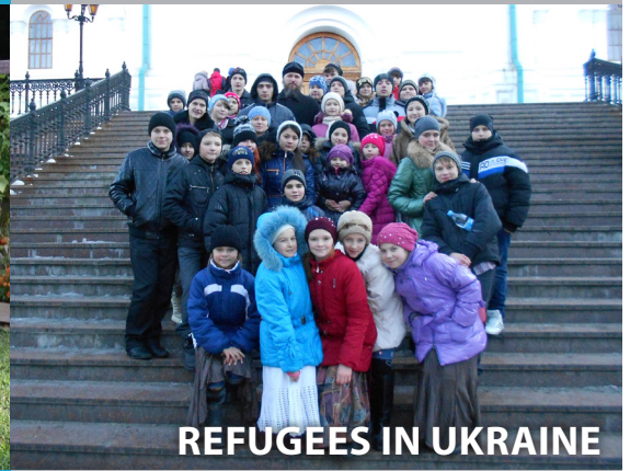
REFUGEES IN UKRAINE