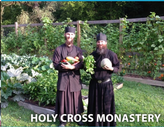
HOLY CROSS MONASTERY