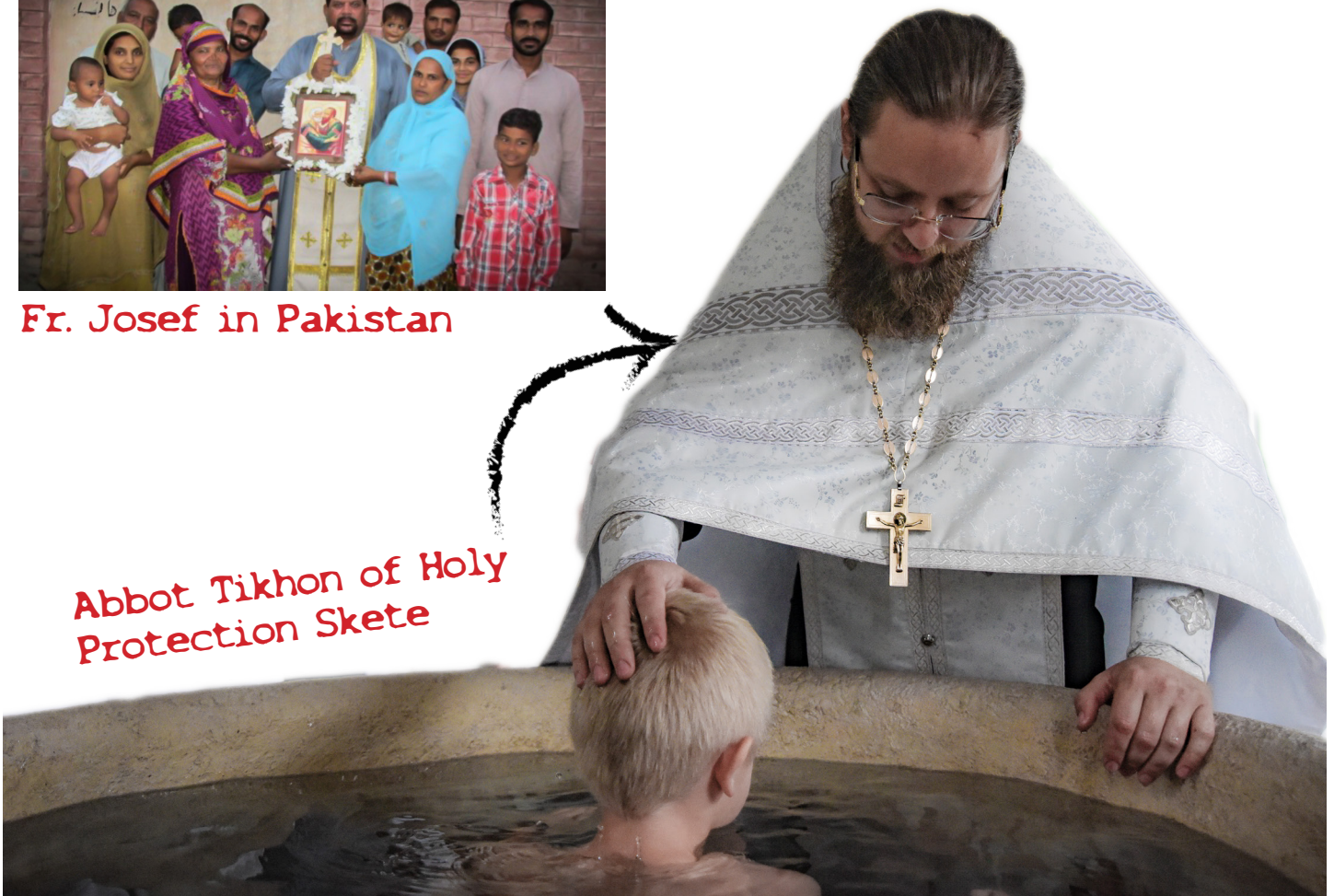
Abbot Tikhon of Holy Protection Skete